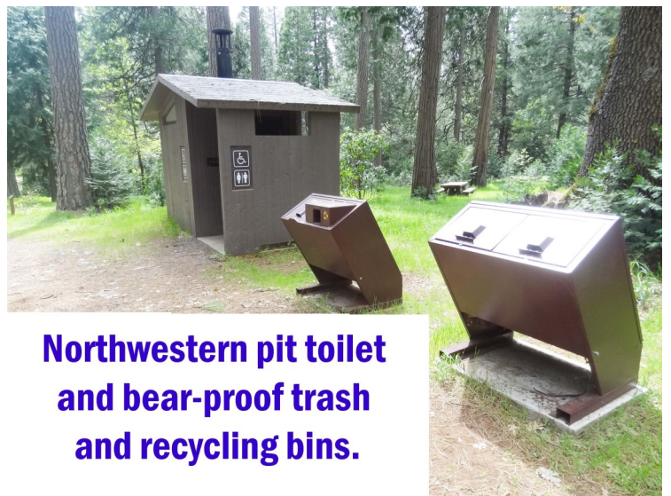
Northwestern pit toilet and bear-proof trash and recycling bins.