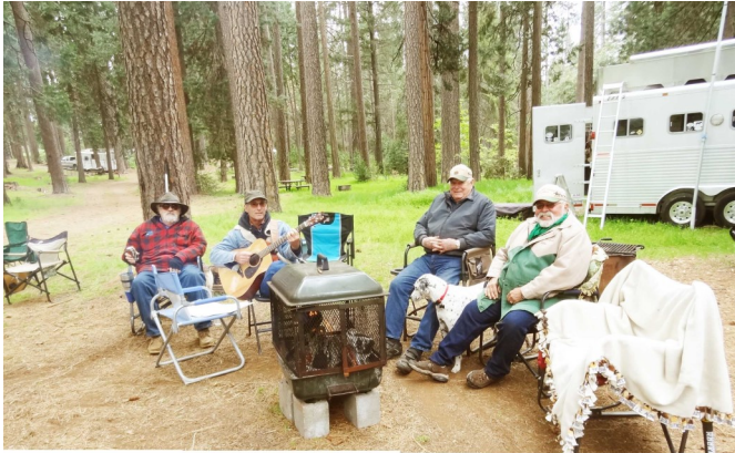
Backcountry Horsemen of California enjoying singing around the campfire at Dru Barner Horse Campground