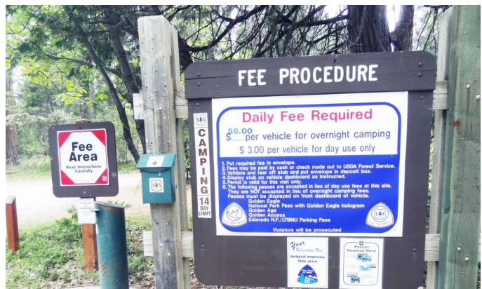
Dru Barner Horse Camping fees: $8.00 per night or $3.00 for day-use