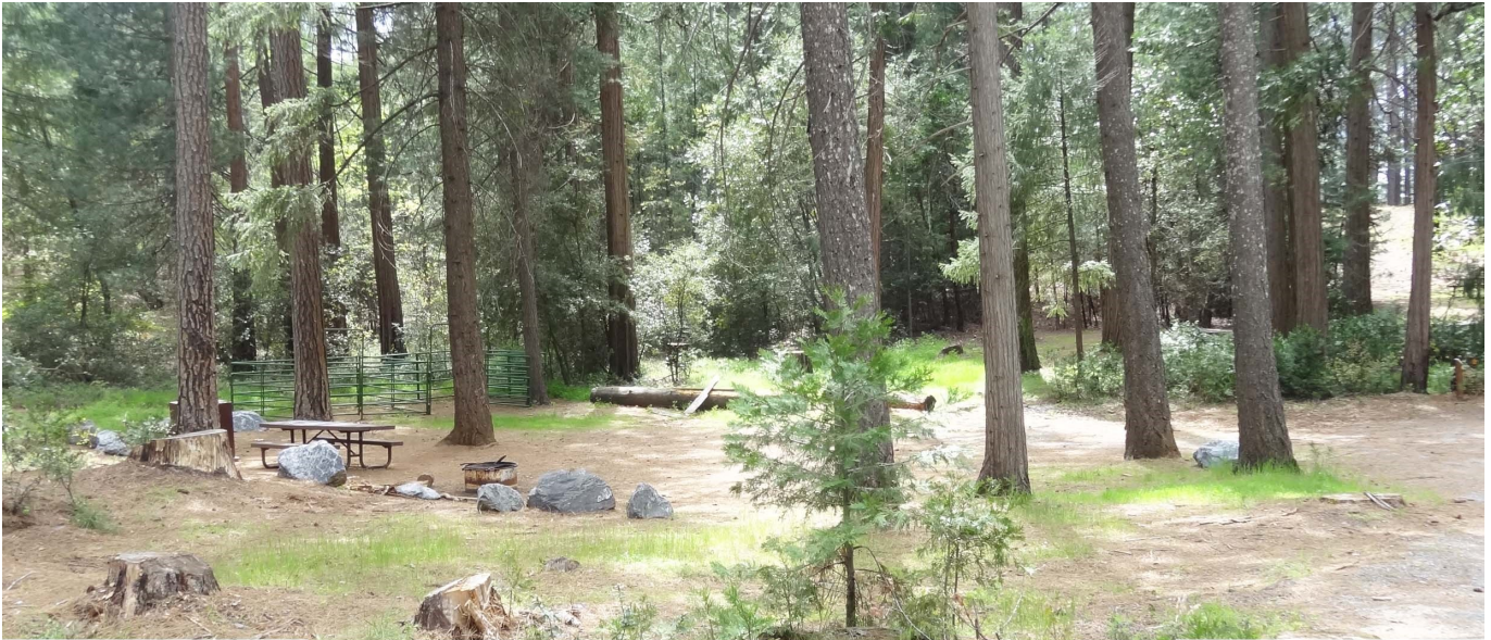
Campsite #23 serves as headquarters during the Gold Country AERC 50-mile Endurance Ride