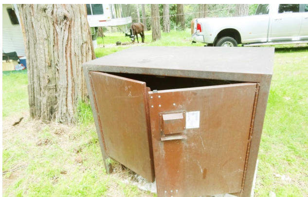
Food lockers keep out bears, raccoons, and squirrels at Dru Barner Horse Campground