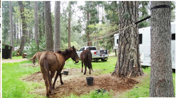
Backcountry Mules Picketed on a High-Line