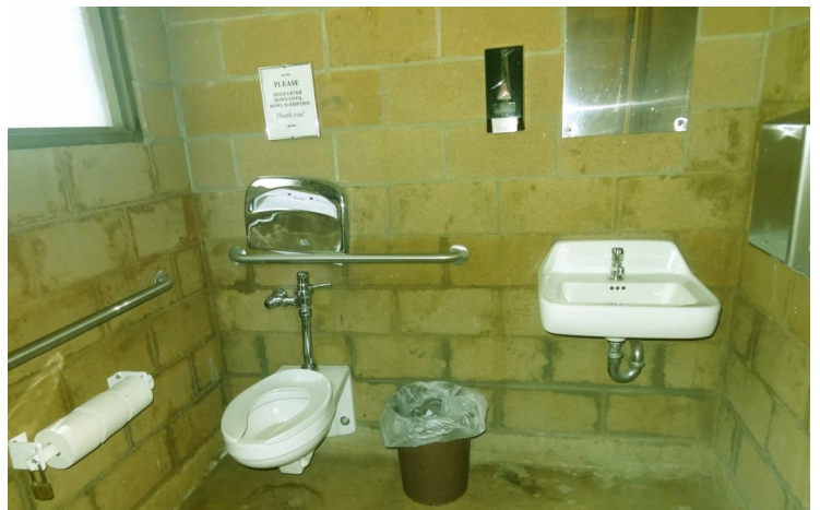
Flush Toilet and Sink for Wash-Up in Southern Outhouse at Dru Barner Horse Camp