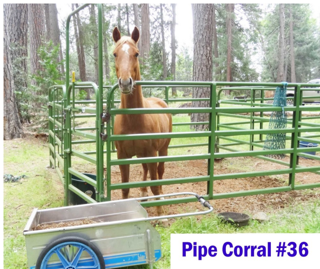
Pipe Corral #36