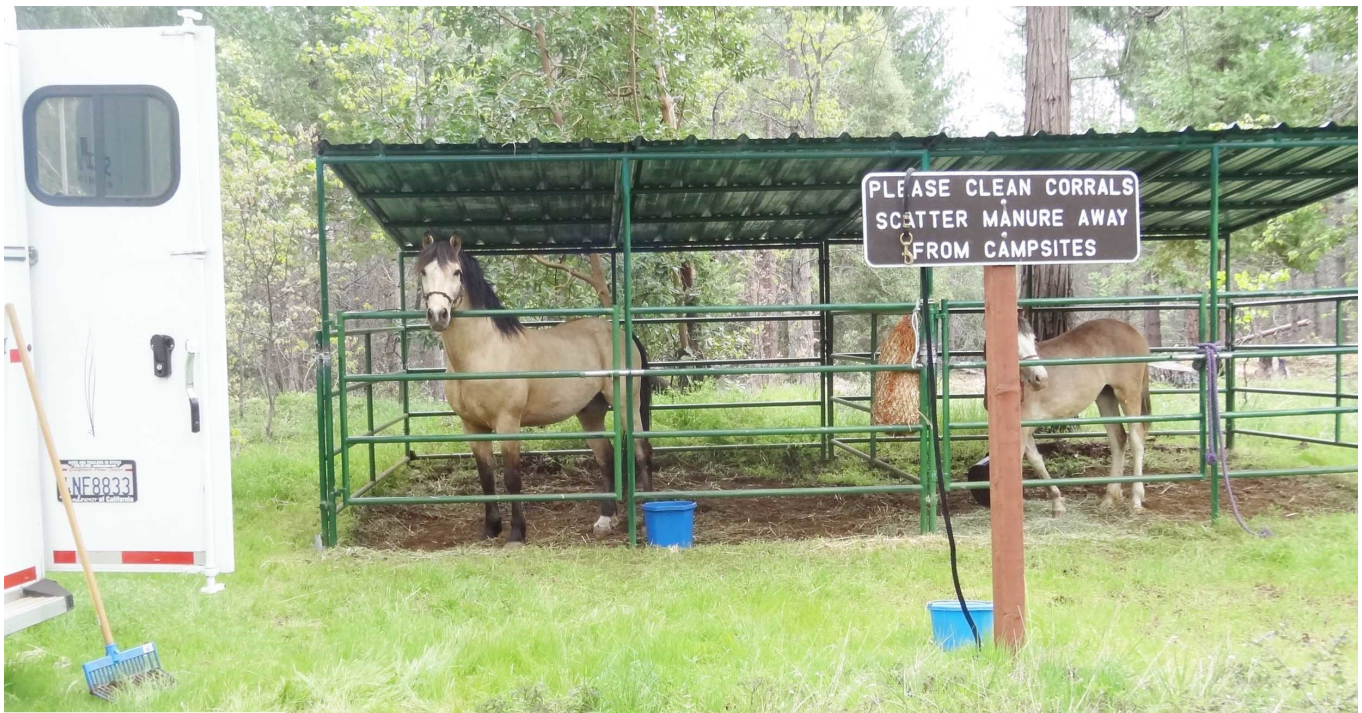
Dru Barner campsites #26 and #28 share a covered pipe corral